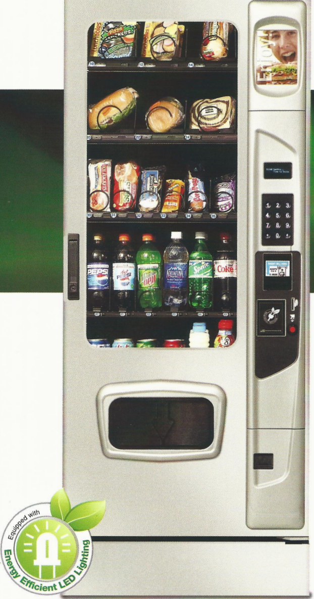
Shown silver & black styling and kick panel options.