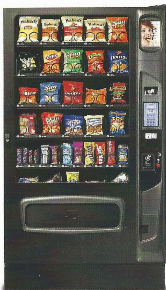
M5000 Shown with iCart touch screen & kick panel options.