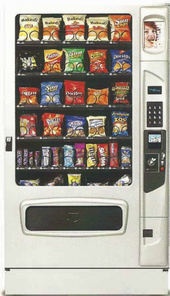
M5000 Shown with silver door color & kick panel options.