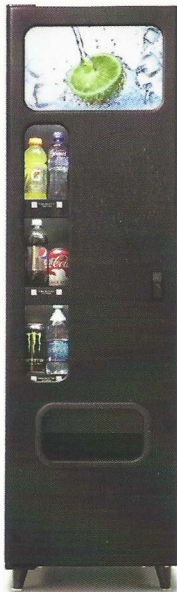
Summit 300 Satellite