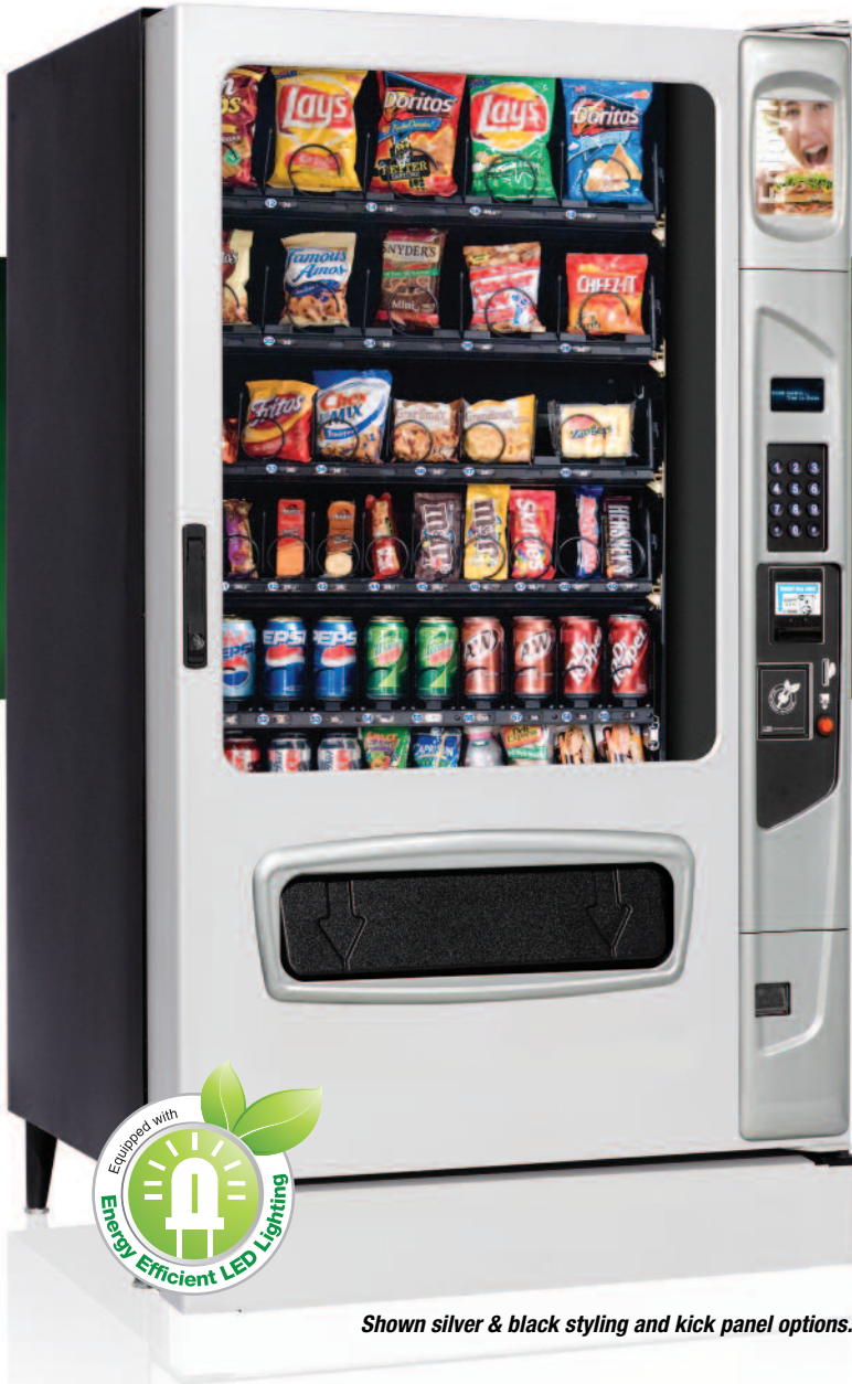
Shown silver & black styling and kick panel options.

The Alpine VT5000 glass front food & beverage merchandiser provides the largest dispensing capability with the highest energy efficiency in the industry. Vend sodas, juices, milk, yogurts, and other foods best served cold from one versatile package.