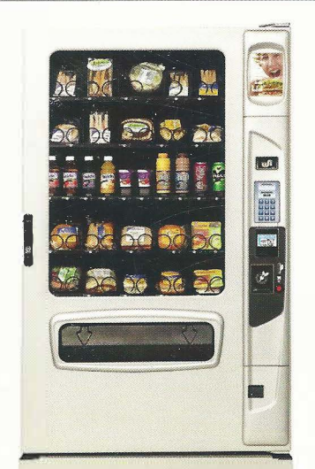
Shown in silver with optional iCart interface & kick panel.