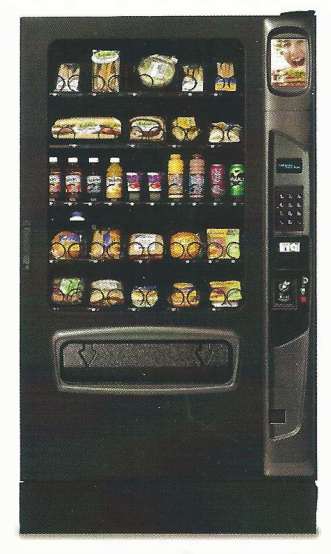
Shown in black with motor pairing and kick panel options.

Note: Not compatible with satellite food or beverage vendors.