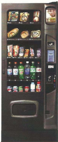
Shown in black with iCart touch screen and kick panel options.