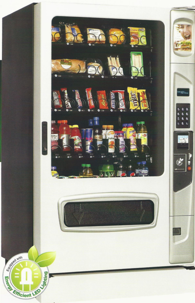
Shown silver & black styling and kick panel options.

The Alpine ST5000 glass front refrigerated food & beverage merchandiser provides the largest dispensing capability with class leading energy efficiency. Vend sodas, juices, milk, yogurts, and other foods best served cold from one versatile package.