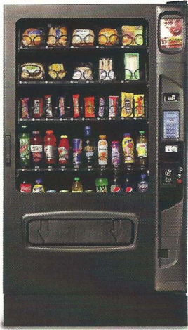
Shown in black with iCart touch screen and kick panel options.